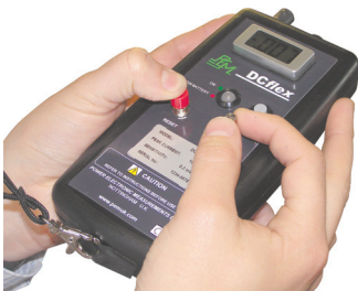
Press the reset button. Null the offset trimmer to zero

The DCflex current probe is simple to use