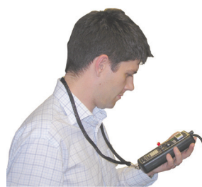
Take the reading