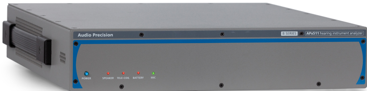
APx511 audio analyzer for hearing instrument production test

AP performance for hearing instrument production test